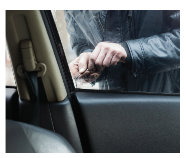
* Insurance Information Institute

A vehicle is stolen in the U.S. every 46 seconds.*