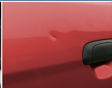
Dent & Ding Repair