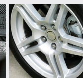
Aftermarket Wheels with no Surcharges