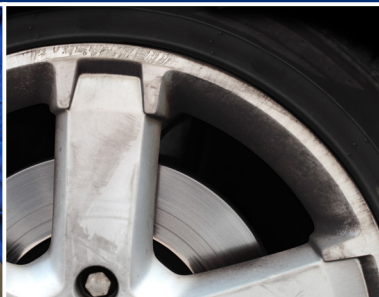
Cosmetic Wheel Coverage