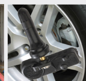
Tire Pressure Monitoring Sensors