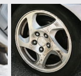
Replacement for Wheels with Unrepairable Cosmetic Damage