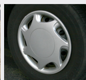
Cosmetic Damage to Wheel Covers (Hubcaps)