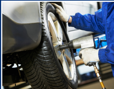
Tire & Wheel