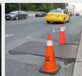
Metal Plates on the Road