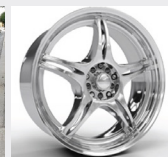
Cosmetic Damage on Chrome & Chrome Clad